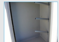
Swing-out Tack Box (can stay outside)

This model also comes standard with: Front Head Divider / Low Side Step / 2x Sliding Drop Windows / 1x Side Rump Window / 2x roof vents / Breakaway / 1 tack door / swinging head divider between bays / 2 TONE PAINT