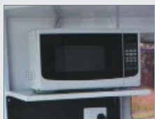
Microwave & 240v Power