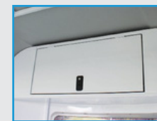
Enclosed Front Rug Rack