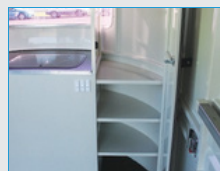
Full Height Wardrobe