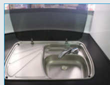
Sink & Water Tank