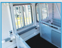
FlexiTravel Adjustable Dividers