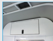
Enclosed Front Rug Rack