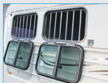
2x Sliding Drop Down Windows