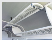
Enclosed Side Rug Rack