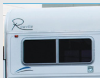
Large Side Windows