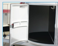
Tackbox with 2 xTack Doors & 2 PA Doors