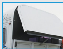
Lift Up Door