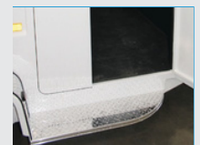
Low Side Steps

This model also comes standard with: 2x Roof Vents / Breakaway.