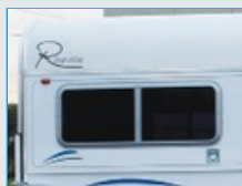
1x Sliding Side Rump Windows