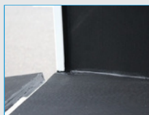
Anti slip rubber floor