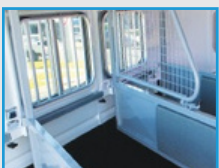
FlexiTravel Adjustable Dividers