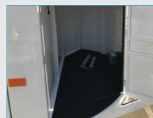
3/4 Tackbox with 1x Door