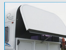
Lift Up Door