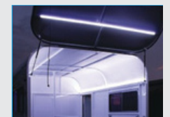
LED Internal Lighting

This model also comes standard with: 2x roof vents / Breakaway / 2 tack doors / swinging head divider between bays.