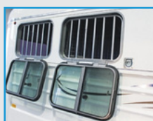
3x Sliding Drop Down Windows