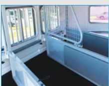
FlexiTravel Adjustable Dividers