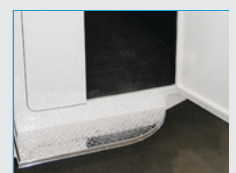
Low Side Step

This model also comes standard with: 4x Roof Vents / Breakaway / 2 Tack Doors / Swinging Head Divider Between Bays.