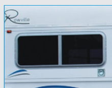
1x Sliding Rump Side Window