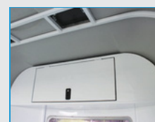
Enclosed Front Rug Rack