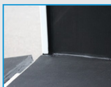
Anti slip rubber floor