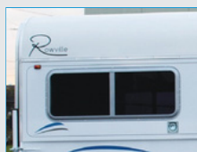
Sliding Side Window