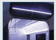
LED Strip Lighting

This model also comes standard with: 2x roof vents / Breakaway / 2 tack doors / swinging head divider between bays.