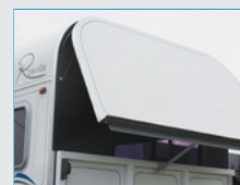
Rear Barn Door