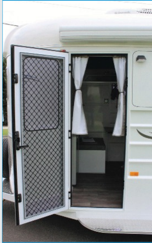
2 HAL LIVING SIDE SEAT / TABLE