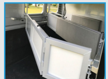
FlexiTravel Adjustable Dividers

This model also comes standard with: 2x roof vents / Breakaway / 2 tack doors / swinging head divider between bays.