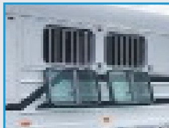
Sliding Drop Down Windows