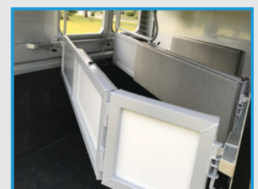
FlexiTravel Adjustable Dividers

This model also comes standard with: 2x roof vents / Breakaway / 2 tack doors / swinging head divider between bays.