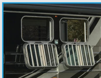
Sliding Drop Down Windows