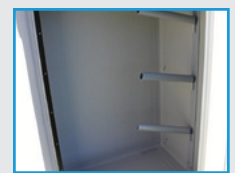
Swing-out Tack Box (can stay outside)

This model also comes standard with: Front Head Divider / Low Side Step / 3x Drop Down Windows / 1x Side Rump Window / 4x roof vents / Breakaway / 1 tack door / swinging head divider between bays