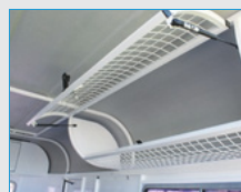
Enclosed Side Rug Rack