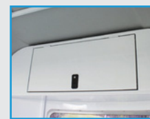
Enclosed Front Rug Rack