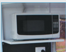
Microwave & 240v Power