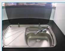
Sink & Water Tank