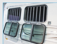
Large flyscreen drop down Side Windows