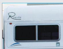
Sliding Rump Side Windows