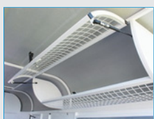
Fully enclosed overhead rug rack